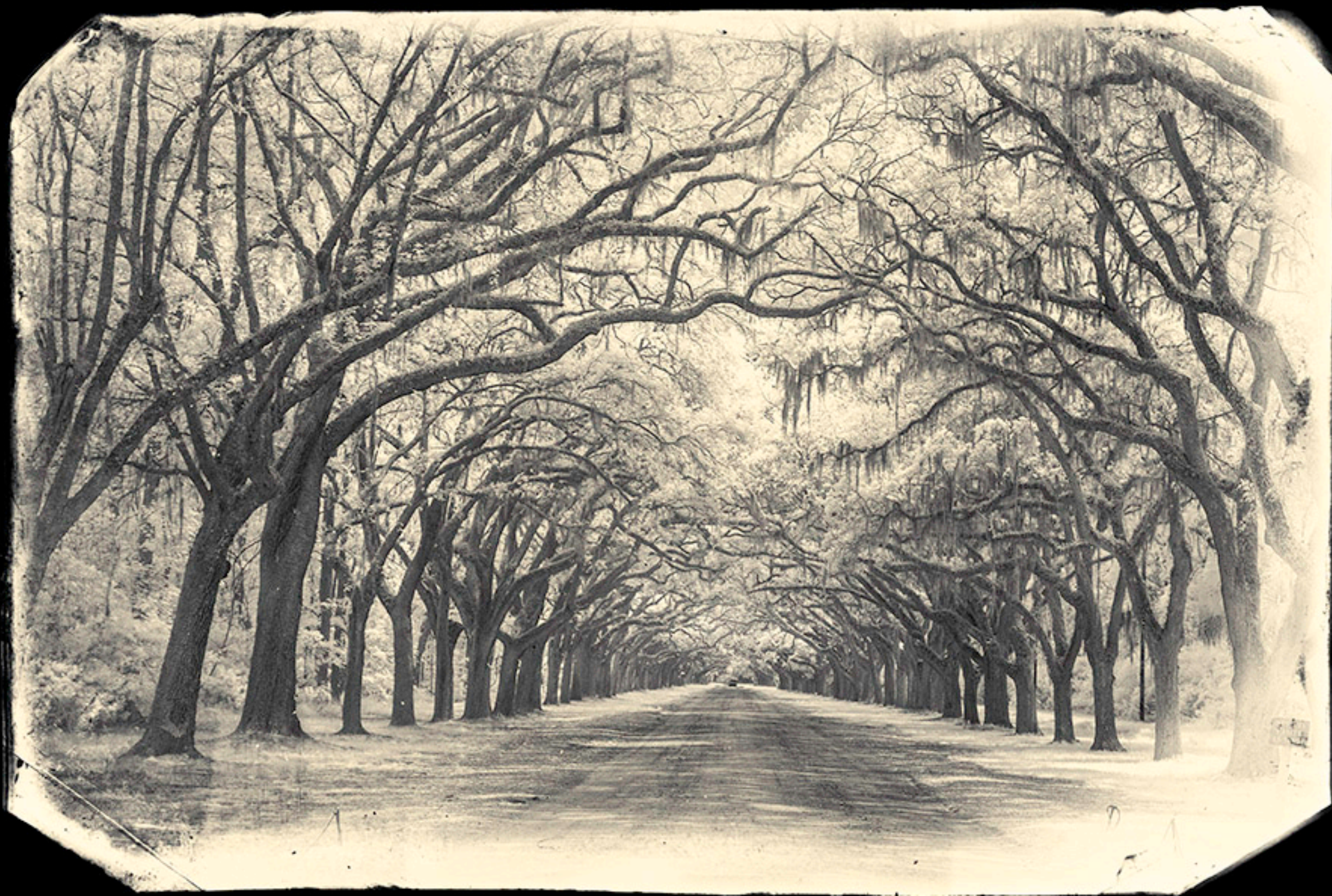
Wormsloe 1077 - Infrared