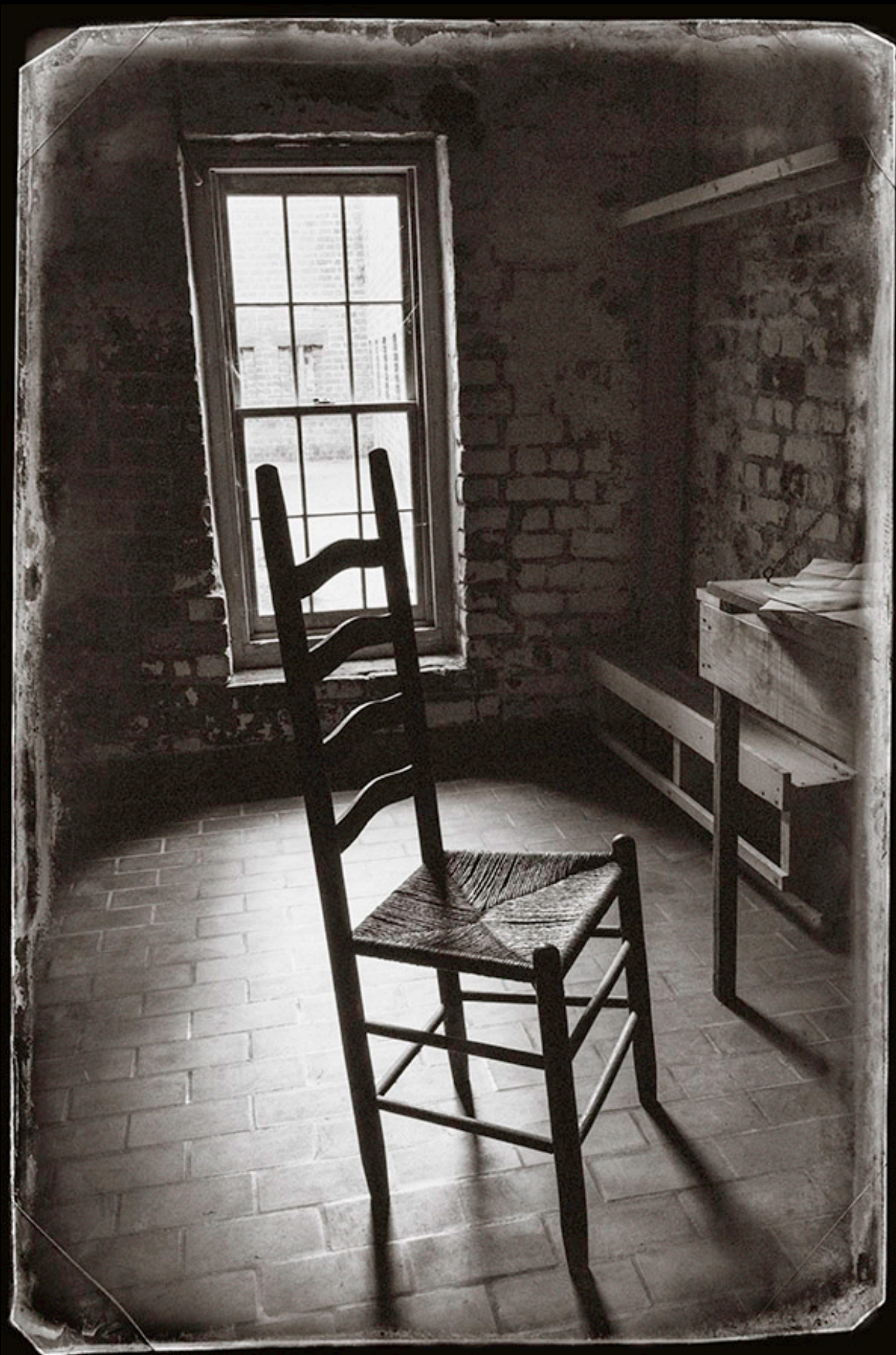
Fort Jackson 6082