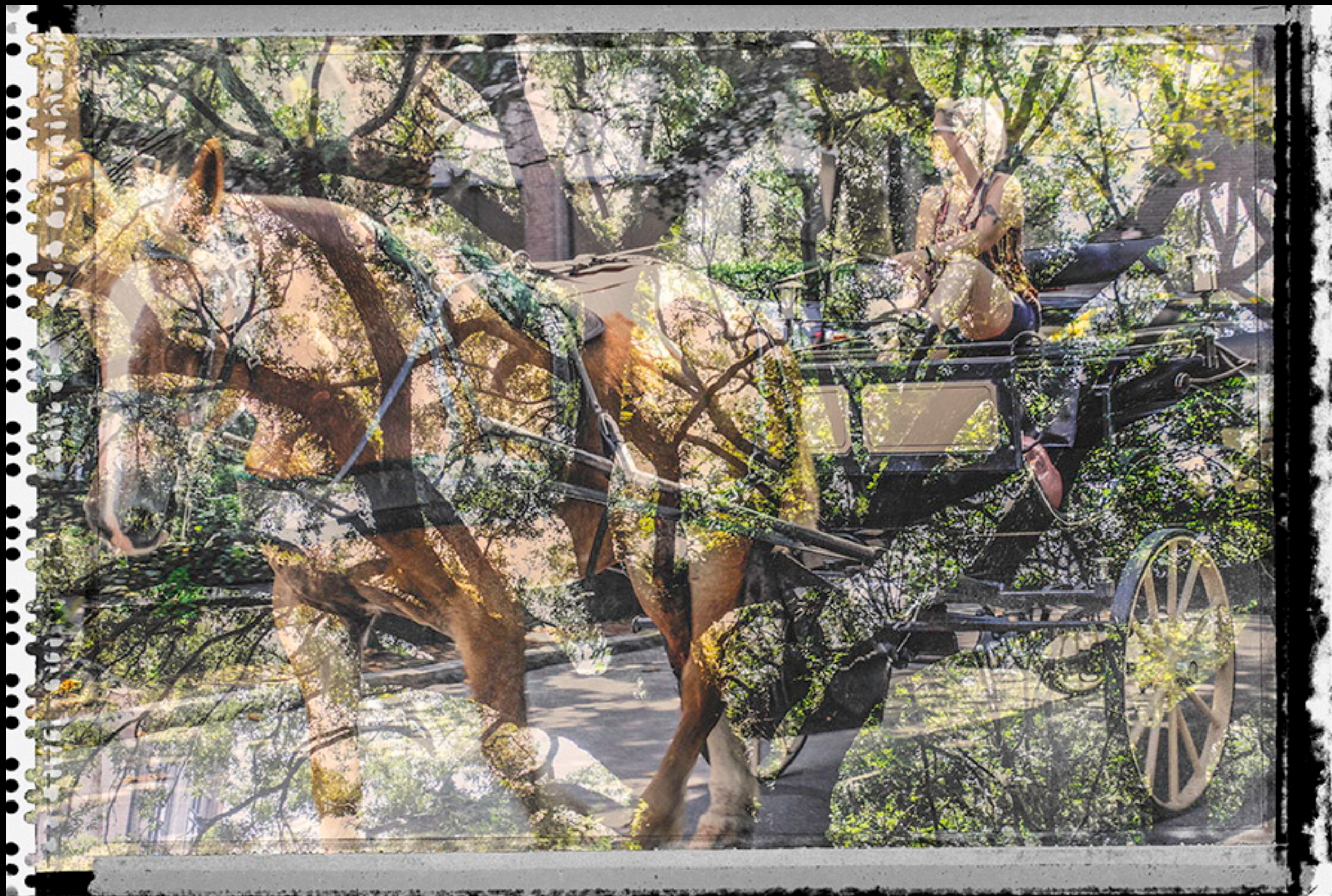
Savannah Buggy & Tree 1111 - Double Exposure