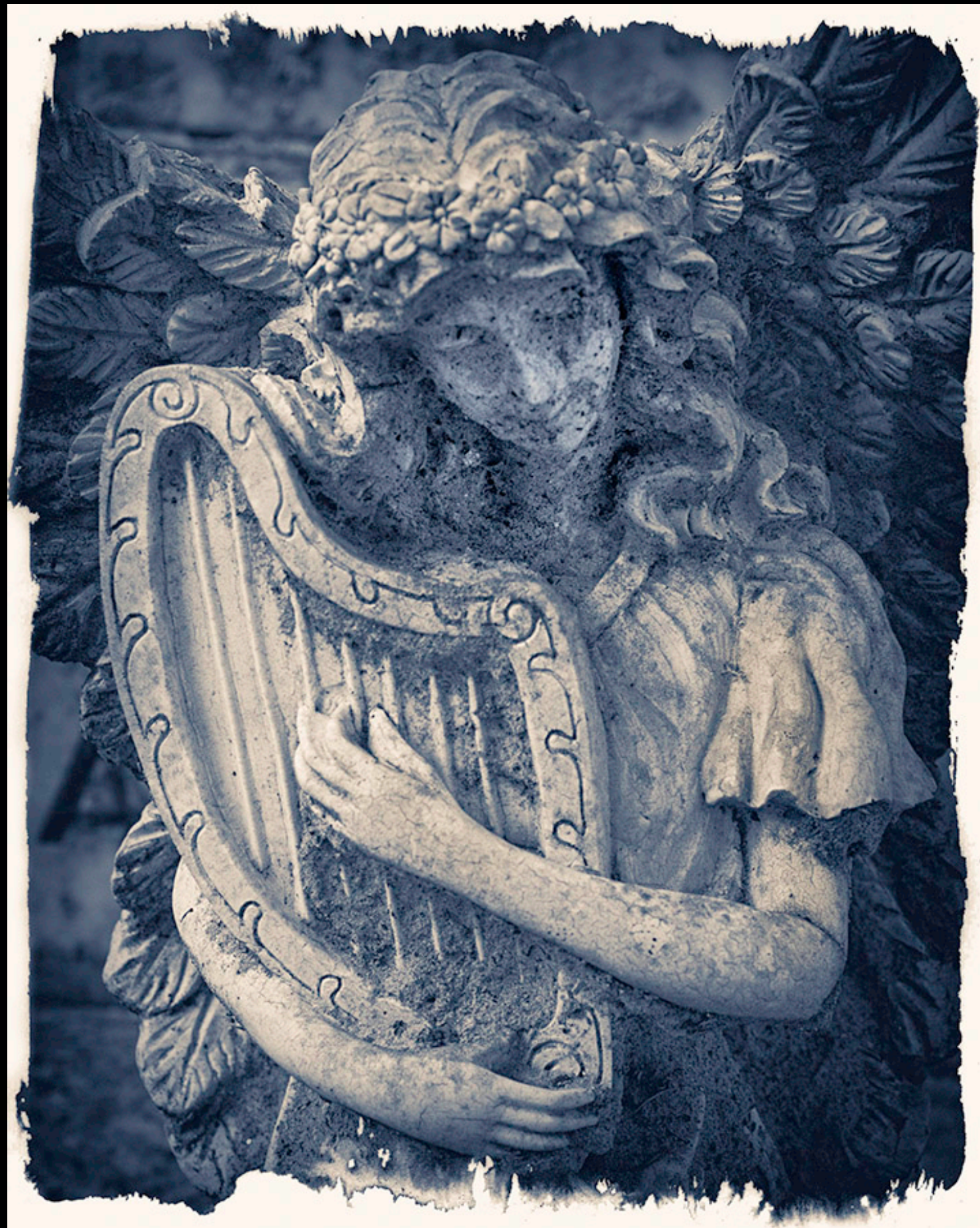
Bonaventure Cemetery 6034