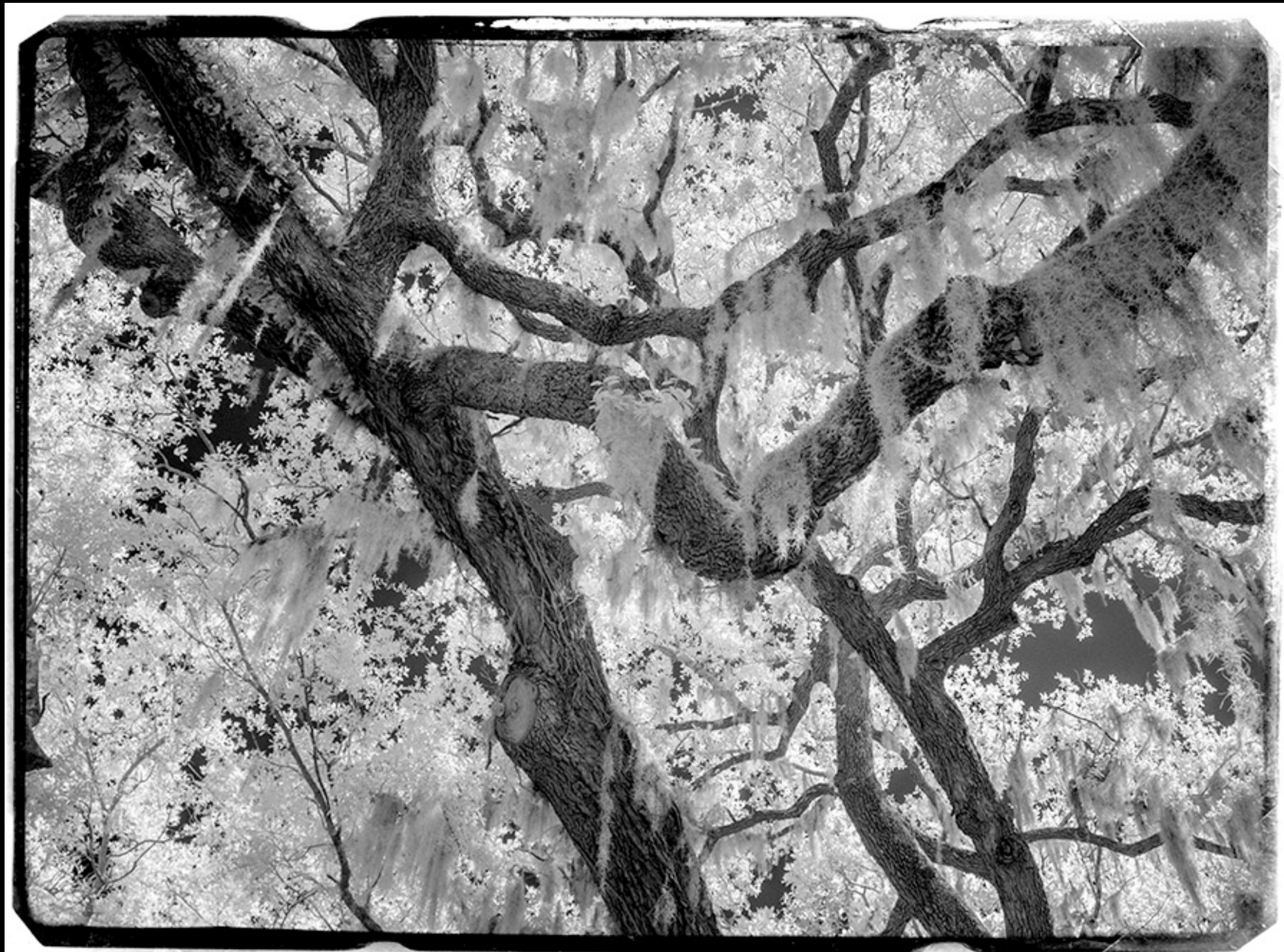
Savannah Trees 1094 - Infrared