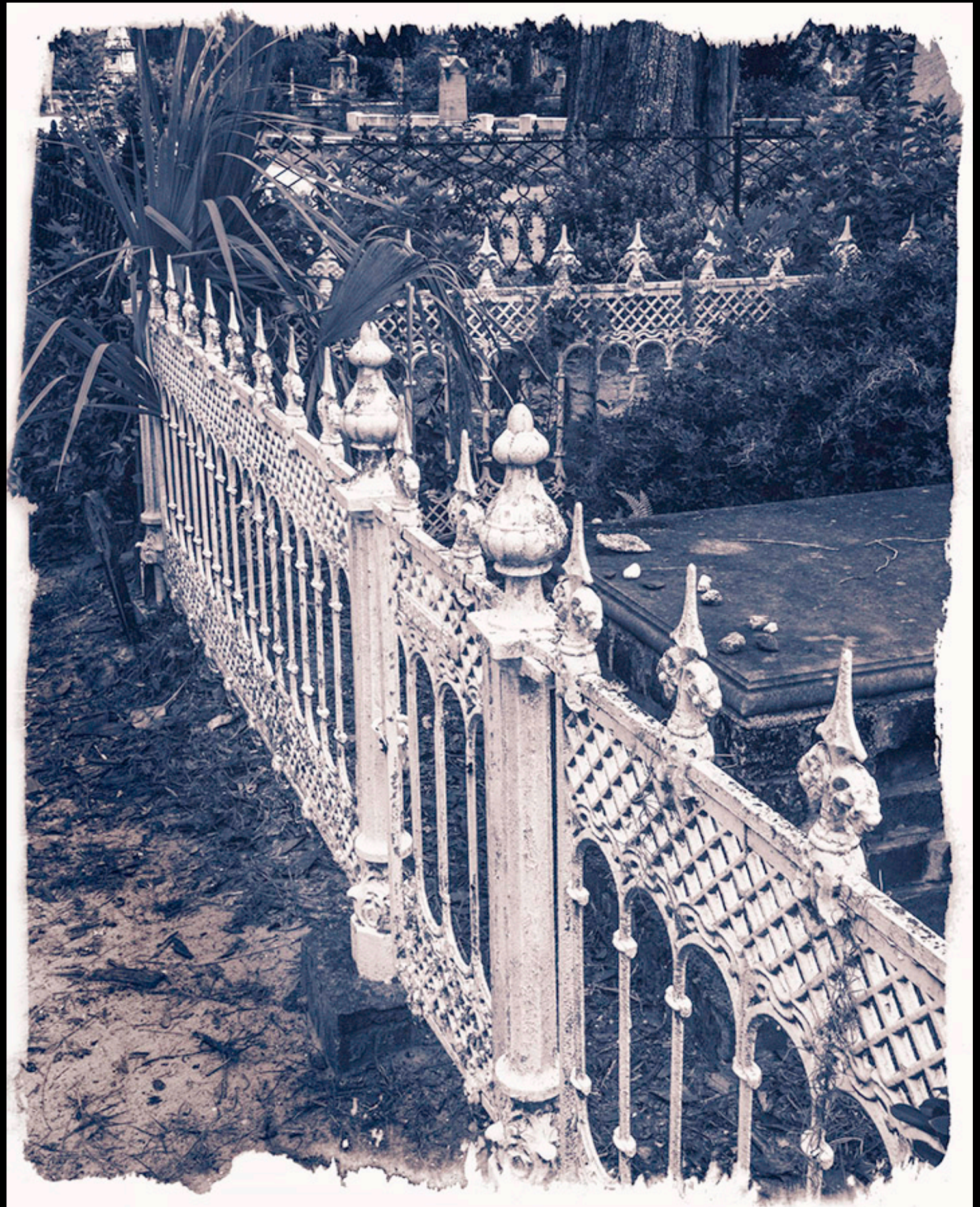
Bonaventure Cemetery 6073