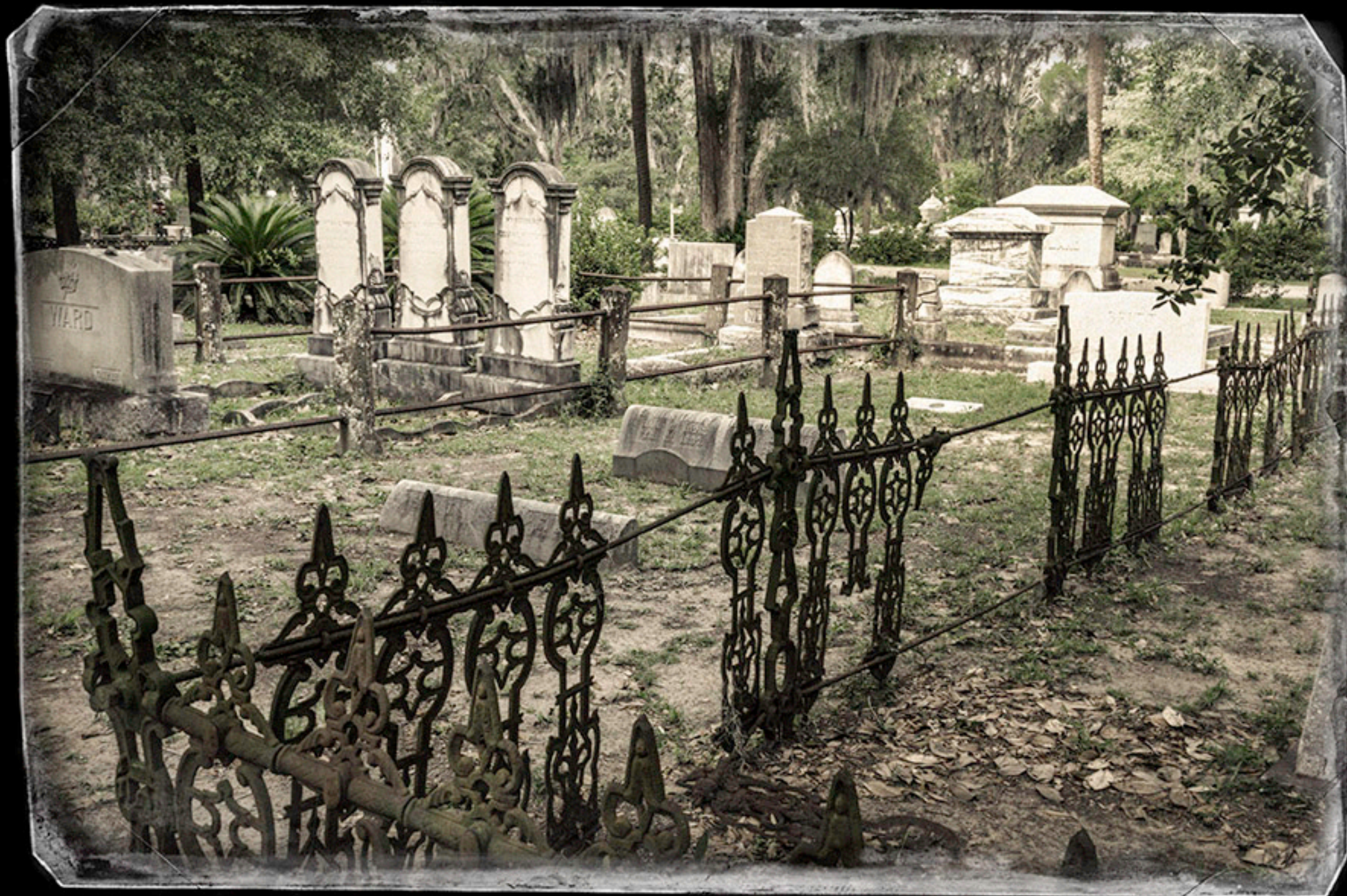
Bonaventure Cemeatery 6070