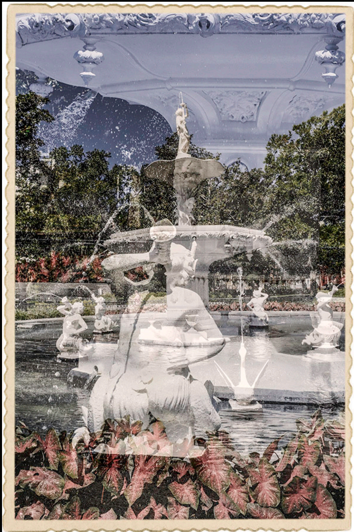
Savannah Forsyth Fountain 1117 Double Exposure