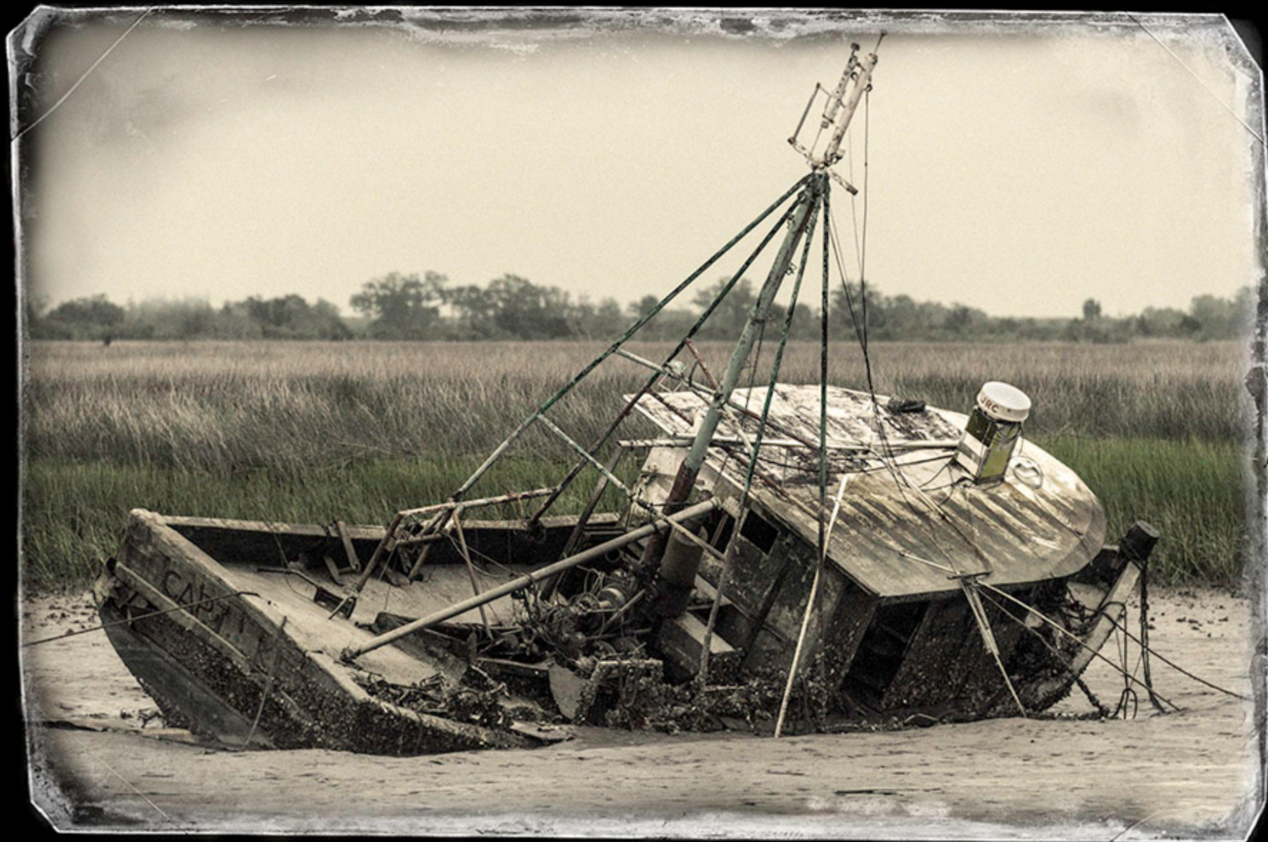
Tybee Shipwreck 6109