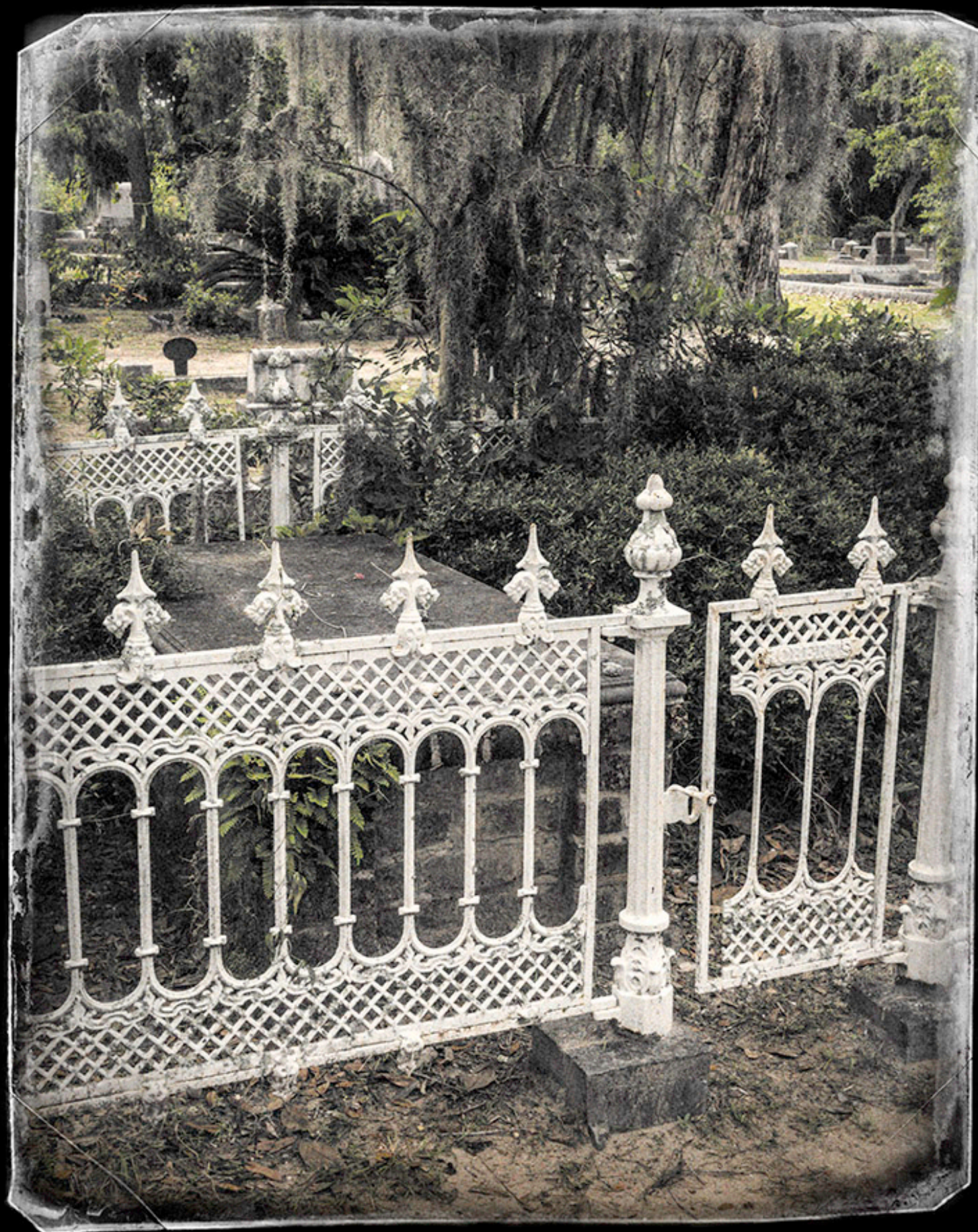
Bonaventure Cemetery 6072