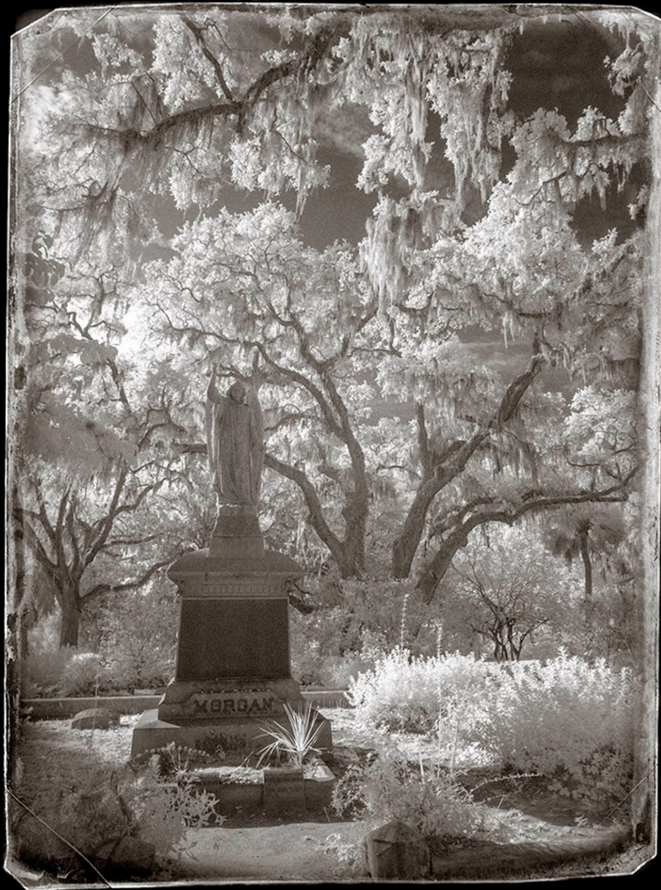
Bonaventure Cemetery 1070 Infrared