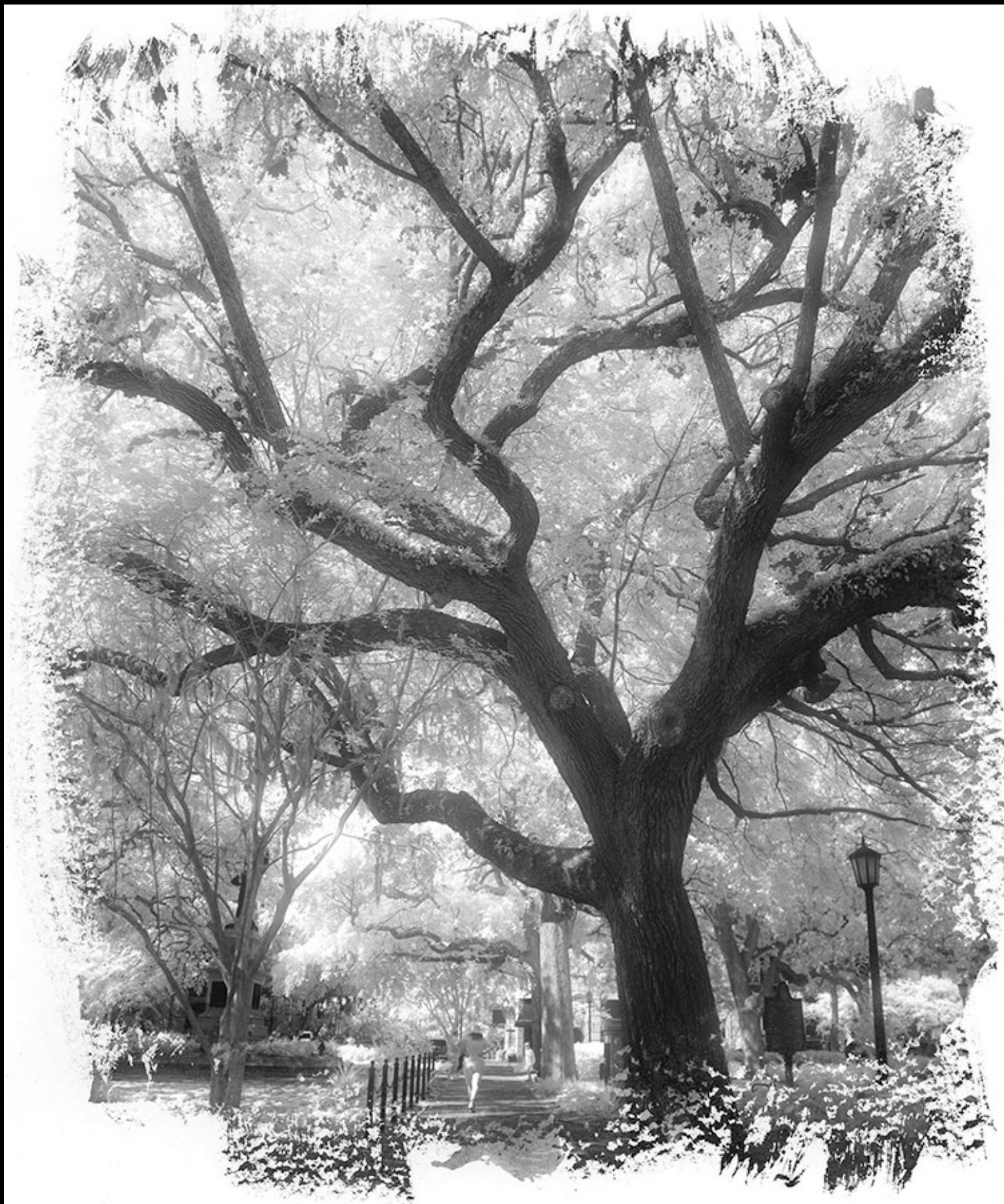
Savannah 1091 Infrared