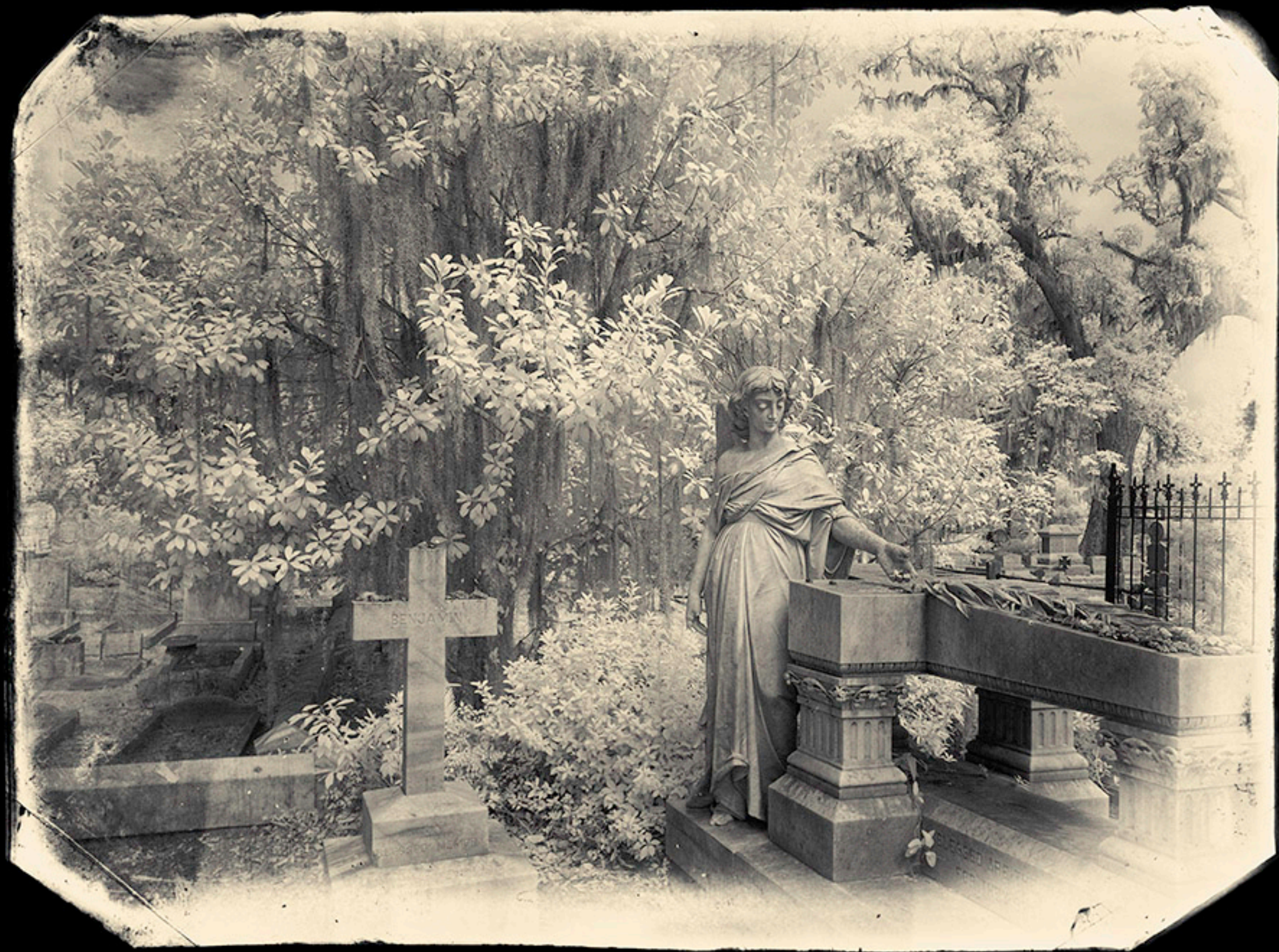
Bonaventure Cemetery 1076 - Infrared