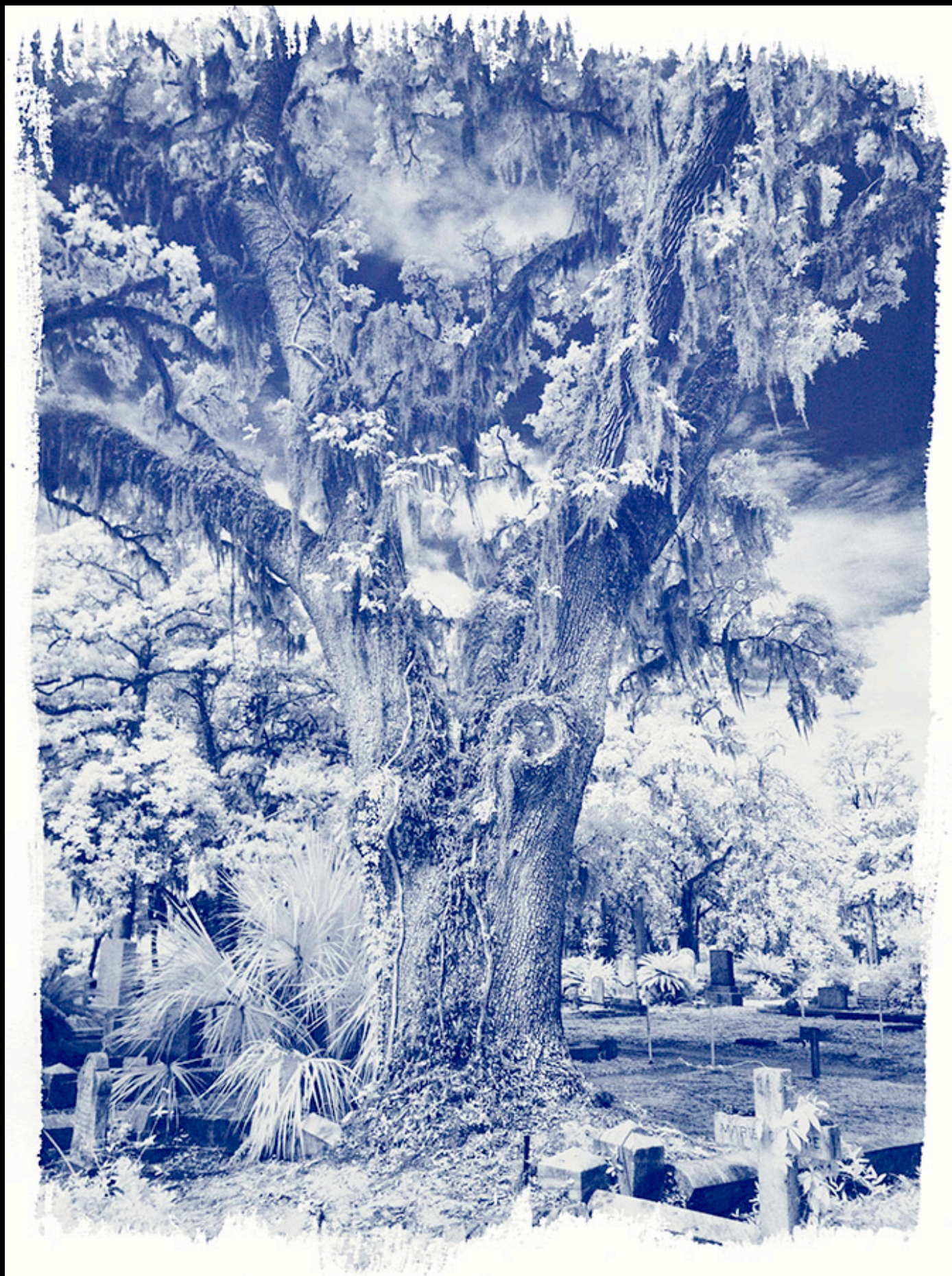
Bonaventure Cemetery 1075 Infrared