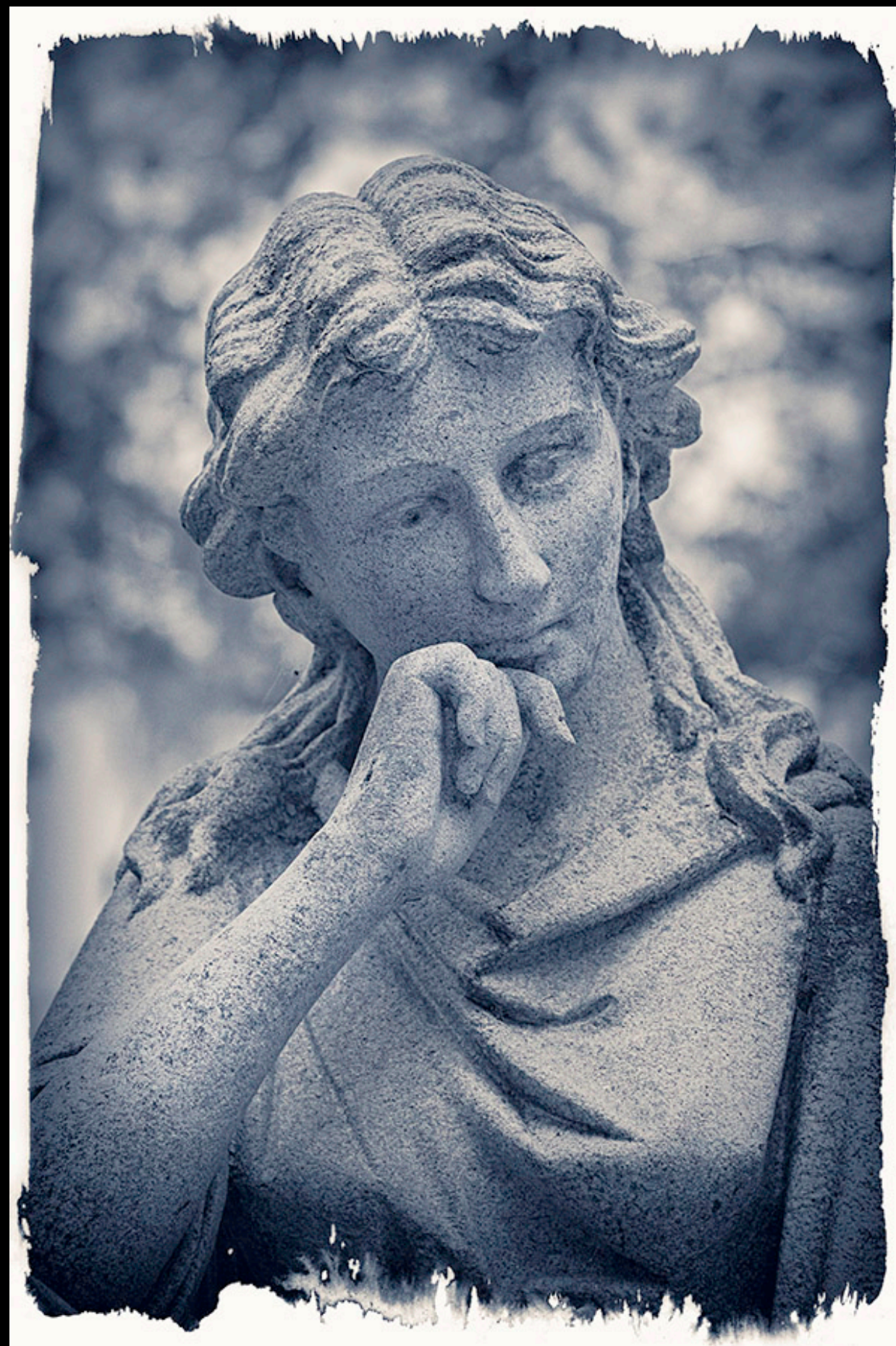
Bonaventure Cemetery 6045