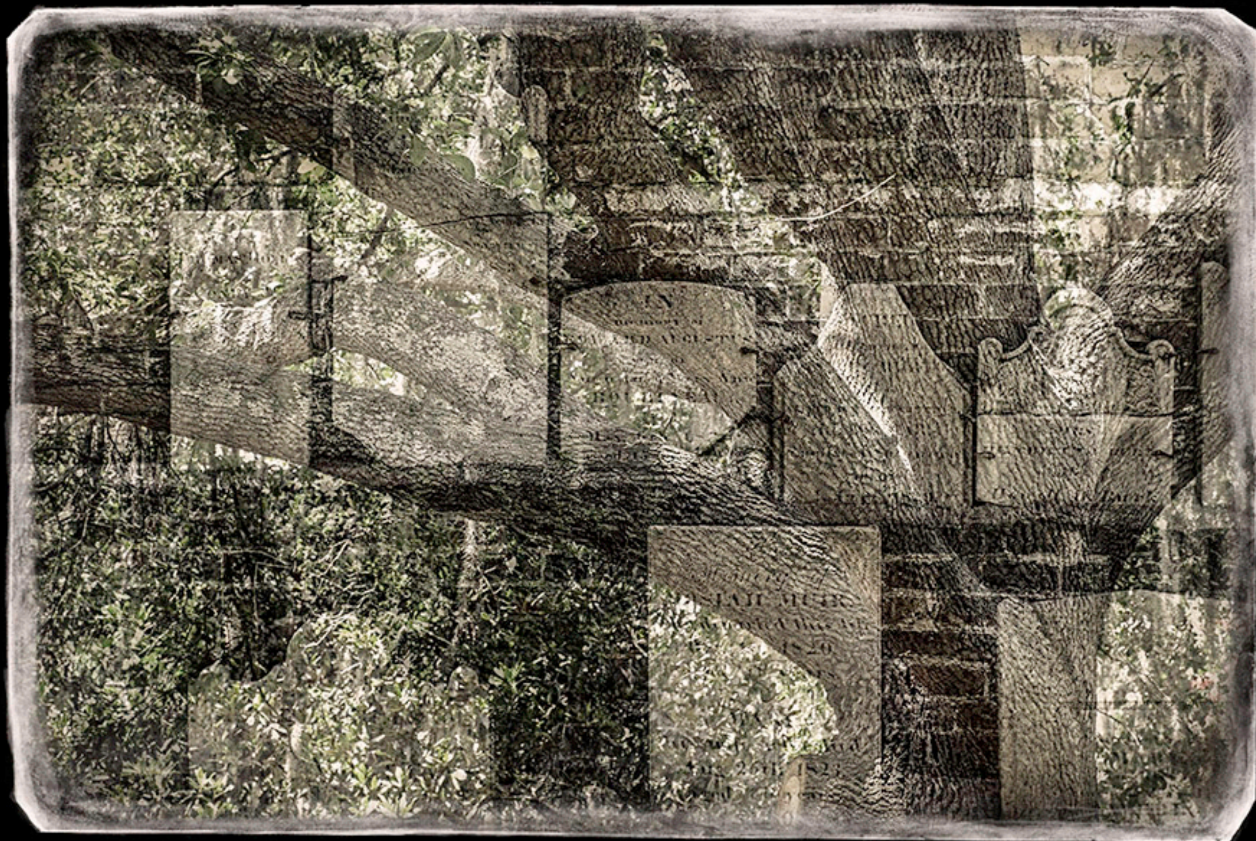
Cemetery 1130 - Double Exposure