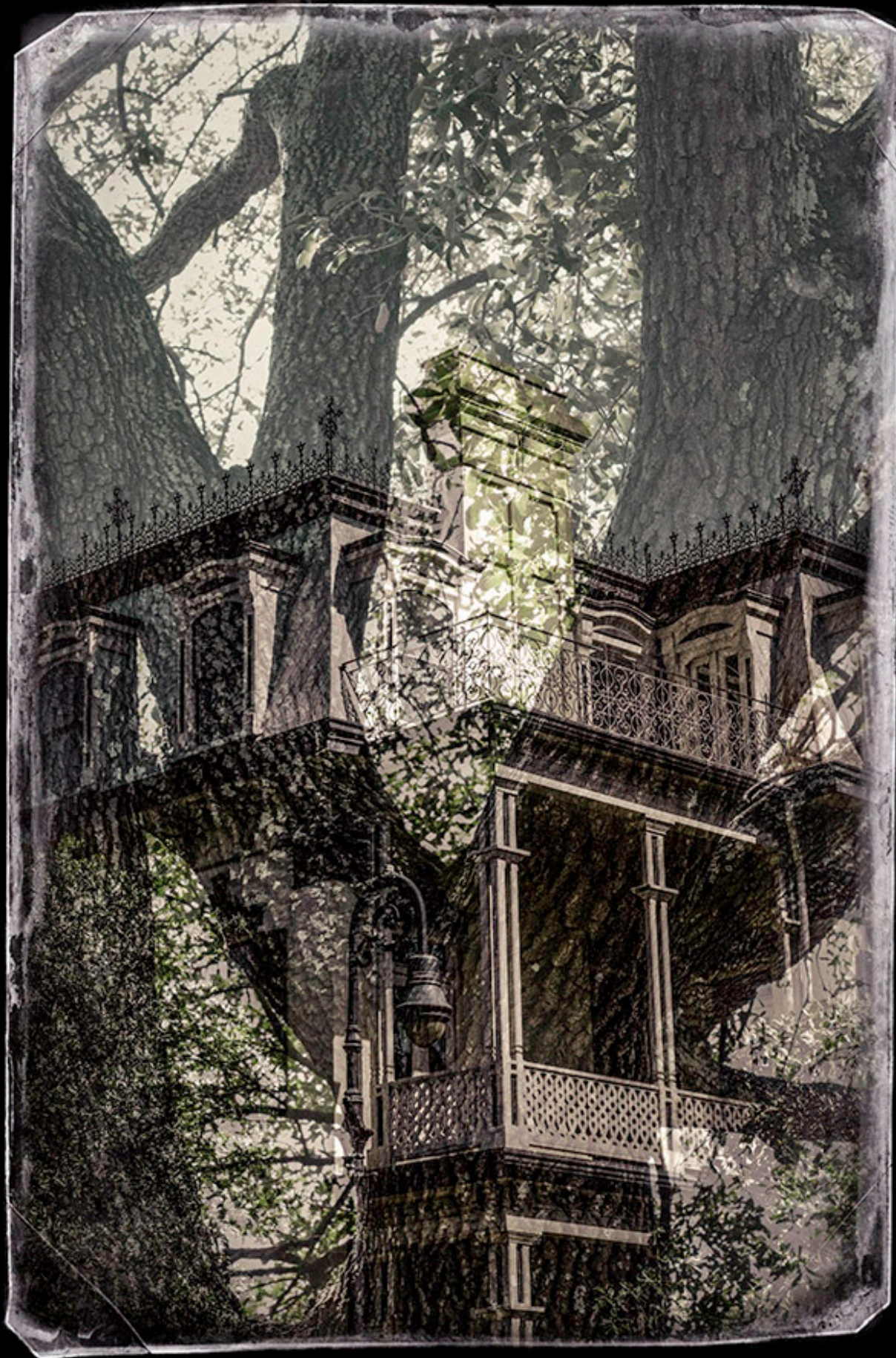
Savannah House & Tree 1108 Double Exposure