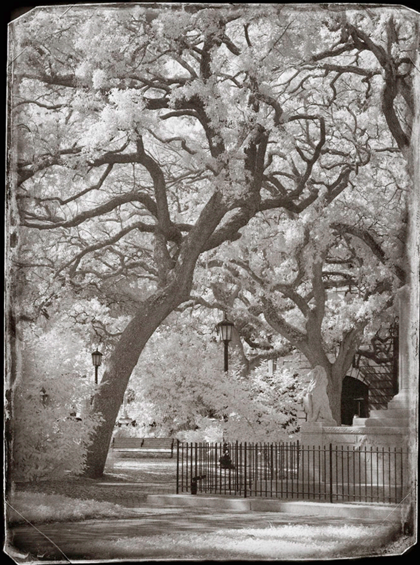
Savannah Square 1087 Infrared