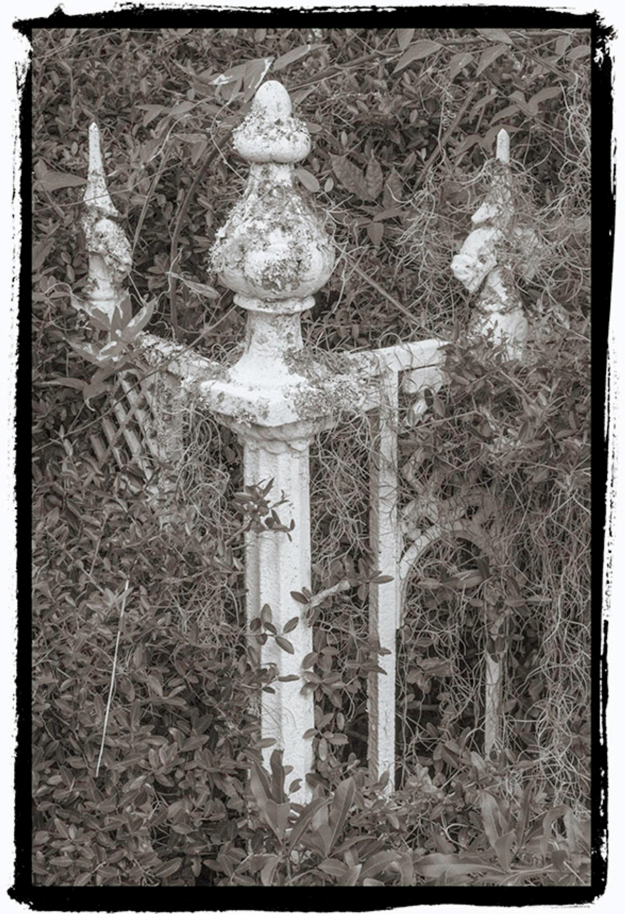
Bonaventure Cemetery 6075