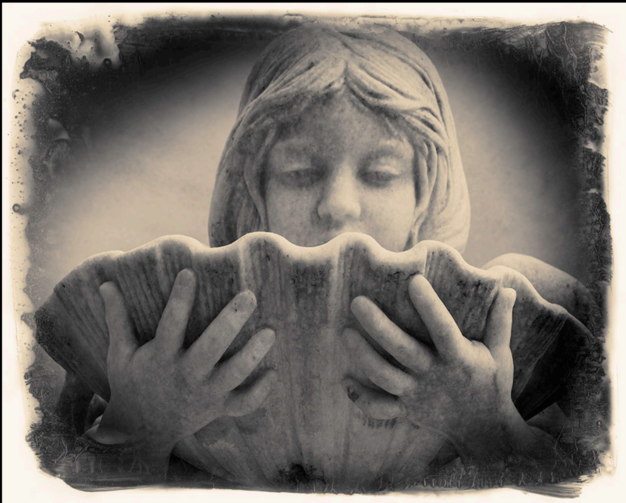
Bonaventure Cemetery 6040