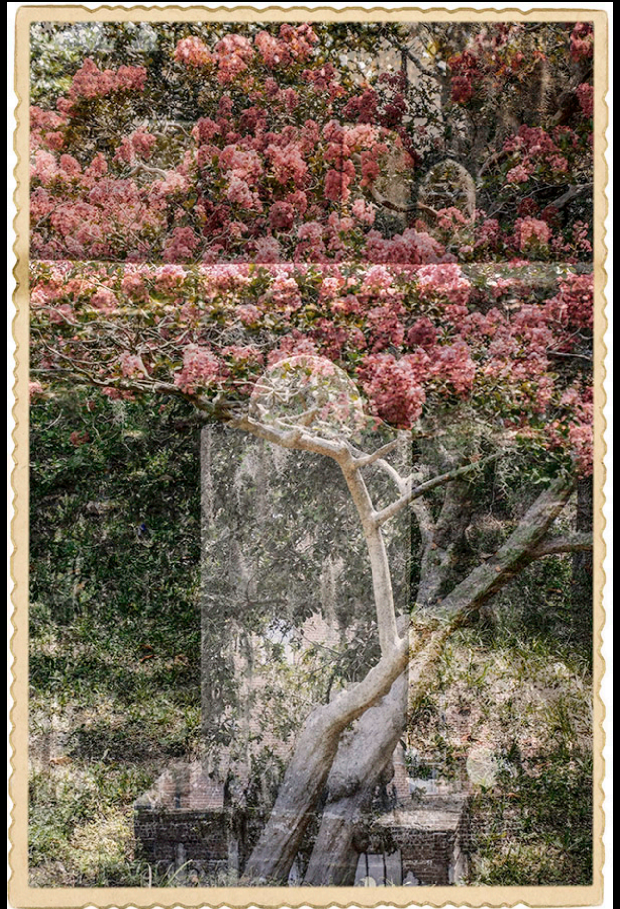
Savannah Tree & Headstone 1127 Double Exposure