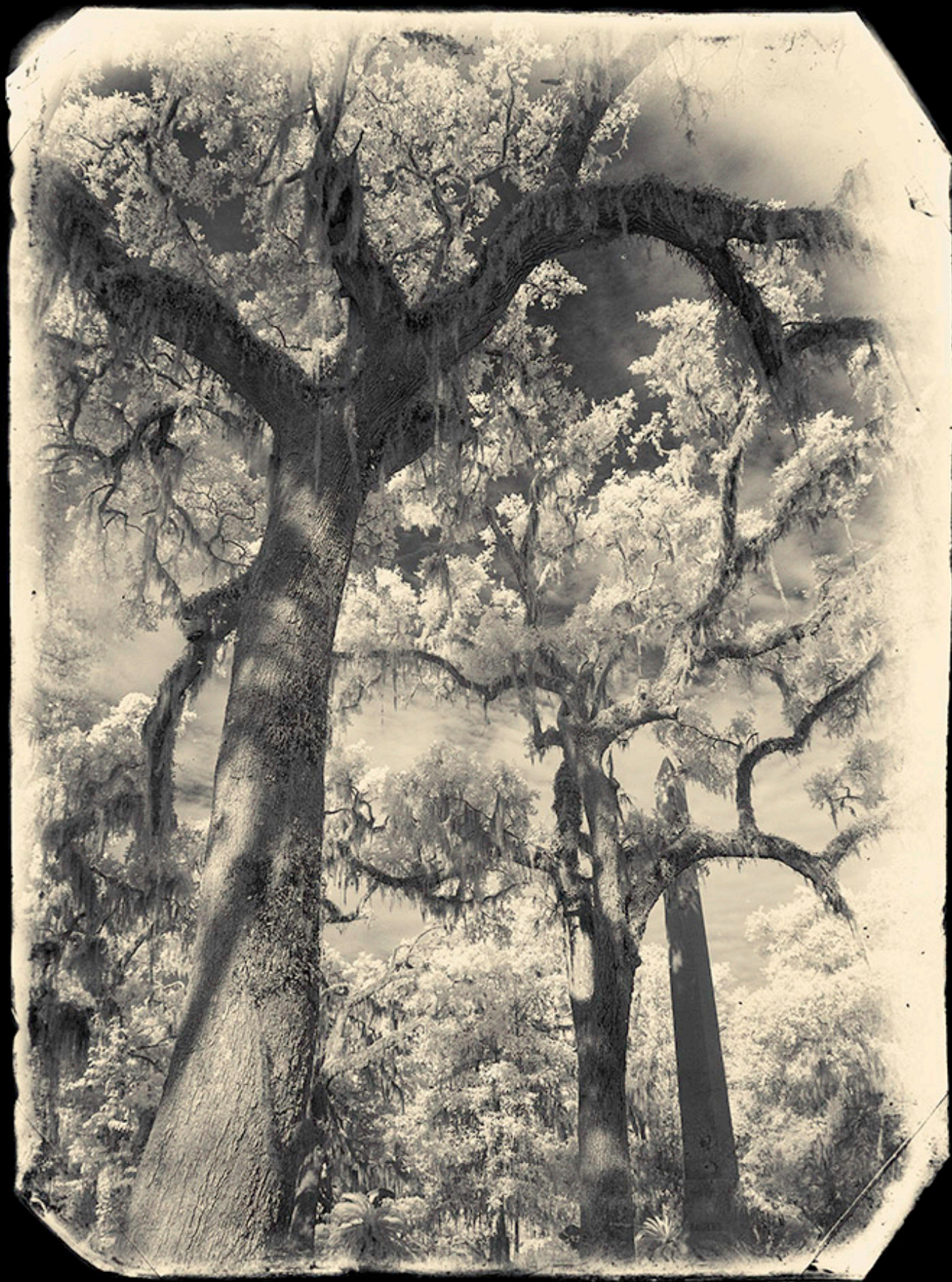
Bonaventure Cemetery Trees 1074 Infrared